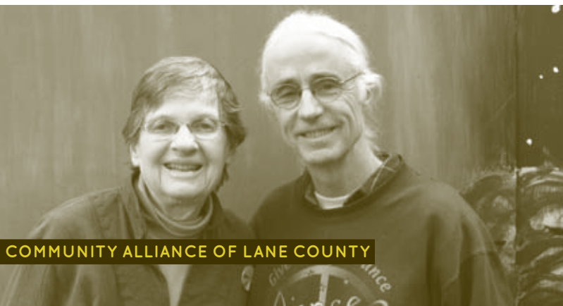
COMMUNITY ALLIANCE OF LANE COUNTY

42% of our grants supported groups based in and led by communities of color.