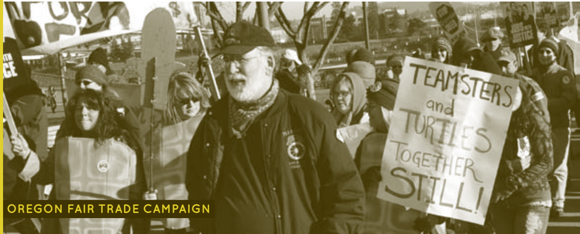
OREGON FAIR TRADE CAMPAIGN