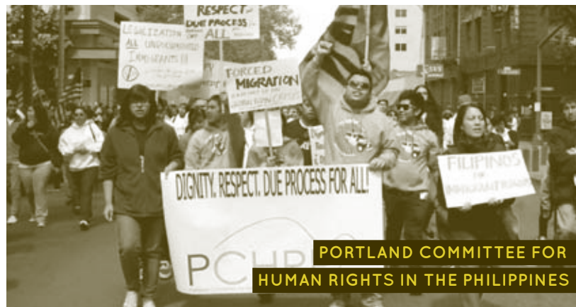
PORTLAND COMMITTEE FOR HUMAN RIGHTS IN THE PHILIPPINES