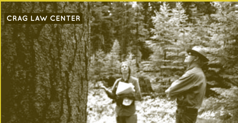
CRAG LAW CENTER

When an Oregon environmental group needs a lawyer to help them protect Oregon's land, air or water, if they're lucky, they get Crag Law Center . Crag's client list includes MRG grantees like Cascadia Wildlands, OPAL, Bark and Friends of Oregon Living Waters.