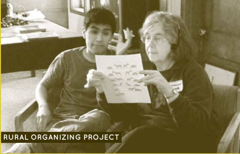
RURAL ORGANIZING PROJECT