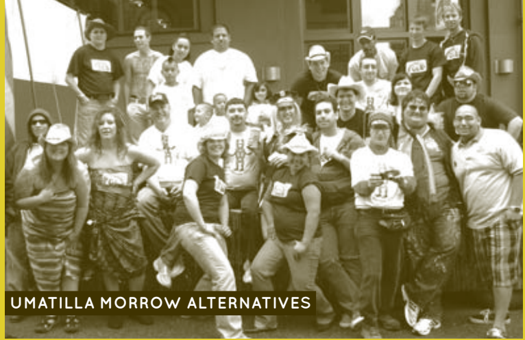
UMATILLA MORROW ALTERNATIVES

Rural Organizing Project (ROP) supports over 50 human dignity groups across the state. Their network engages over 12,000 rural Oregonians in communities like Willowa, Newport, Prineville, and Klamath Falls to organize for peace, LGBTQ equality, immigration reform and democracy.